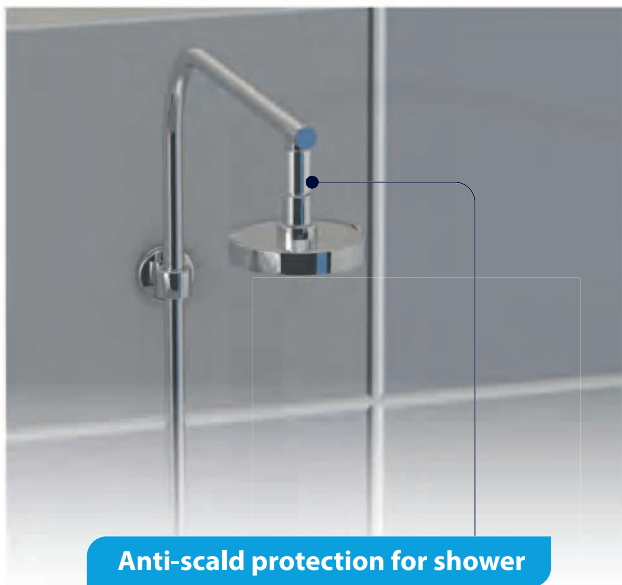
Anti-scald protection for shower