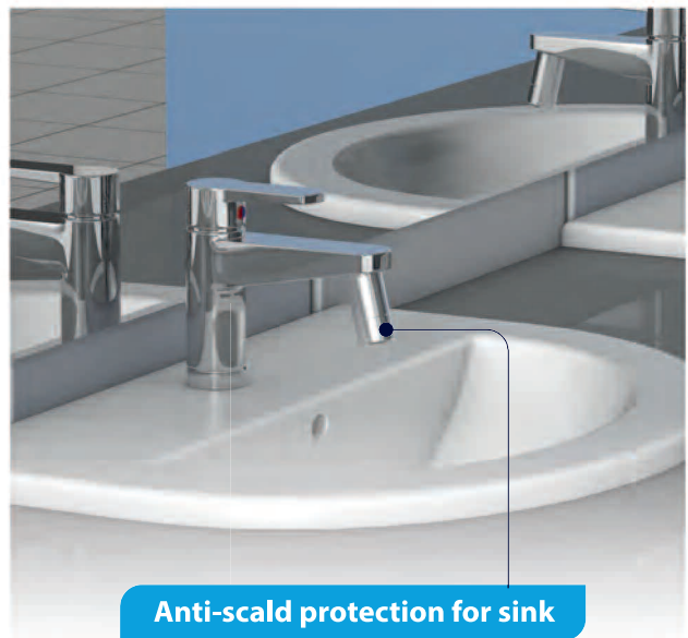
Anti-scald protection for sink

It is MANDATORY that the system should feature anti-scald protection at every draw off point to protect users in the event of accidental use during the thermal disinfection cycles. The cartridges will cut off the water flow whenever the temperature exceeds 48 °C.